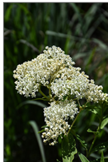
Ice Ballet Milkweed flowers