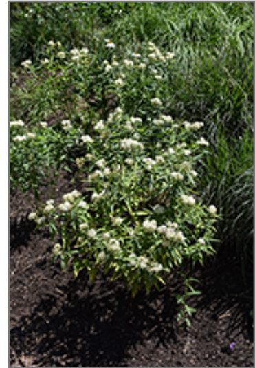
Ice Ballet Milkweed in bloom

This plant does best in full sun to partial shade. It is quite adaptable, preferring to grow in average to wet conditions, and will even tolerate some standing water. It is not particular as to soil type or pH. It is quite intolerant of urban pollution, therefore inner city or urban streetside plantings are best avoided. This is a selection of a native North American species. It can be propagated by division; however, as a cultivated variety, be aware that it may be subject to certain restrictions or prohibitions on propagation.