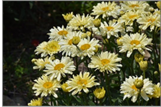
Amazing Daisies Banana Cream II Shasta Daisy flowers

Amazing Daisies Banana Cream II Shasta Daisy is an herbaceous perennial with an upright spreading habit of growth. Its medium texture blends into the garden, but can always be balanced by a couple of finer or coarser plants for an effective composition.