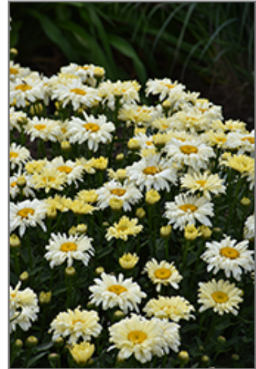
Amazing Daisies Banana Cream II Shasta Daisy flowers

Amazing Daisies Banana Cream II Shasta Daisy is a fine choice for the garden, but it is also a good selection for planting in outdoor pots and containers. With its upright habit of growth, it is best suited for use as a 'thriller' in the 'spiller-thriller-filler' container combination; plant it near the center of the pot, surrounded by smaller plants and those that spill over the edges. Note that when growing plants in outdoor containers and baskets, they may require more frequent waterings than they would in the yard or garden.