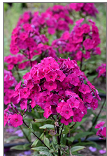
Super Ka-Pow Fuchsia Garden Phlox flowers