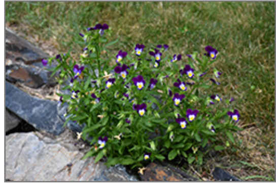
Johnny Jump-Up in bloom

Johnny Jump-Up will grow to be only 4 inches tall at maturity extending to 6 inches tall with the flowers, with a spread of 6 inches. When grown in masses or used as a bedding plant, individual plants should be spaced approximately 5 inches apart. It grows at a fast rate, and tends to be biennial, meaning that it puts on vegetative growth the first year, flowers the second, and then dies. However, this species tends to self-seed and will thereby endure for years in the garden if allowed. As an herbaceous perennial, this plant will usually die back to the crown each winter, and will regrow from the base each spring. Be careful not to disturb the crown in late winter when it may not be readily seen!