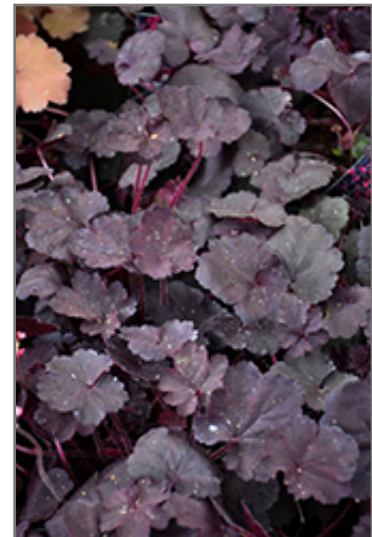
Black Forest Cake Coral Bells foliage