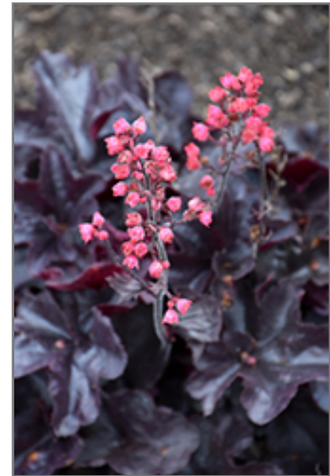
Black Forest Cake Coral Bells flowers

Black Forest Cake Coral Bells is recommended for the following landscape applications;