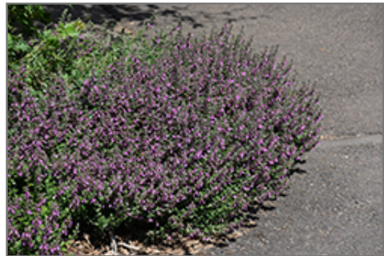
Creeping Germander in bloom