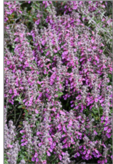
Creeping Germander flowers