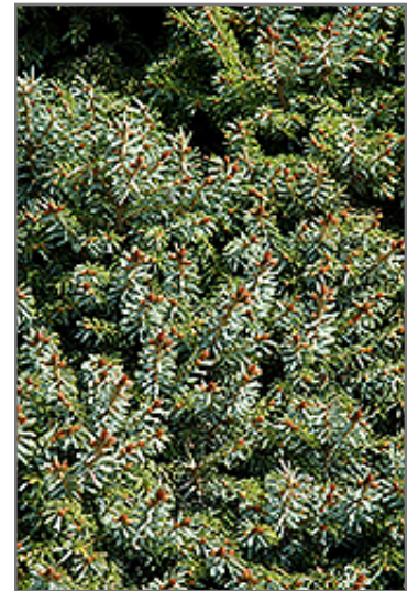
Dwarf Serbian Spruce foliage