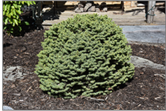
Dwarf Serbian Spruce