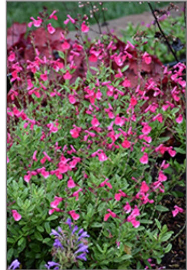
Mirage Hot Pink Autumn Sage flowers

Mirage Hot Pink Autumn Sage is an herbaceous evergreen perennial with an upright spreading habit of growth. Its medium texture blends into the garden, but can always be balanced by a couple of finer or coarser plants for an effective composition.