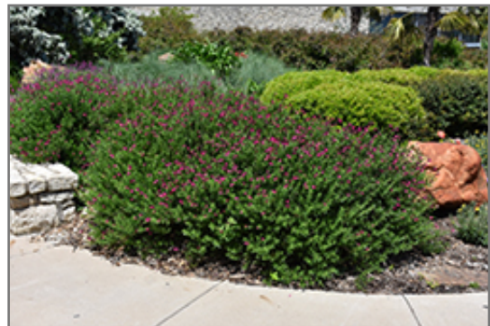
Mirage Hot Pink Autumn Sage in bloom