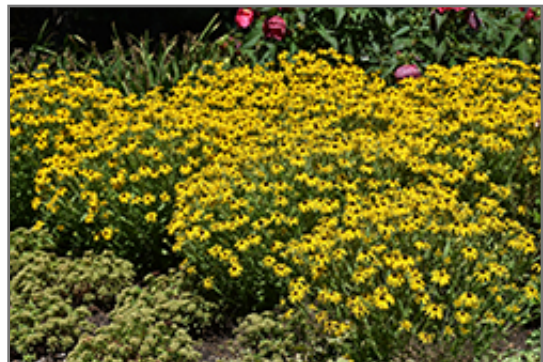
American Gold Rush Coneflower in bloom