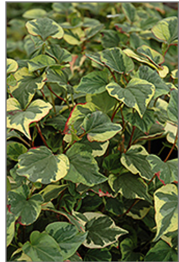
Variegated Chameleon Plant foliage