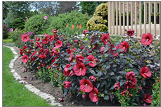
Summerific Holy Grail Hibiscus in bloom