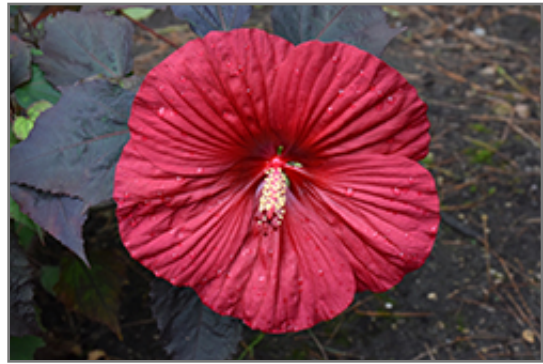
Summerific Holy Grail Hibiscus flowers

Summerific Holy Grail Hibiscus is an herbaceous perennial with an upright spreading habit of growth. Its relatively coarse texture can be used to stand it apart from other garden plants with finer foliage.