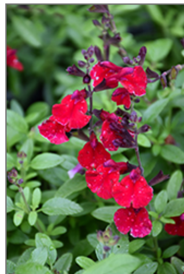
Mirage Cherry Red Autumn Sage flowers