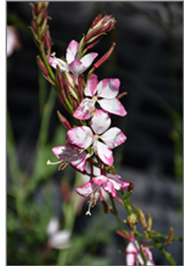
Rosy Jane Gaura flowers

Rosy Jane Gaura is recommended for the following landscape applications;