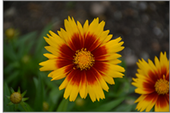
UpTick Gold and Bronze Tickseed flowers

UpTick Gold and Bronze Tickseed will grow to be about 12 inches tall at maturity, with a spread of 14 inches. Its foliage tends to remain dense right to the ground, not requiring facer plants in front. It grows at a medium rate, and under ideal conditions can be expected to live for approximately 10 years. As an herbaceous perennial, this plant will usually die back to the crown each winter, and will regrow from the base each spring. Be careful not to disturb the crown in late winter when it may not be readily seen!