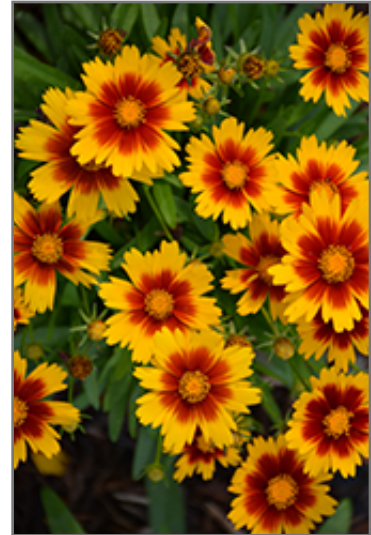
UpTick Gold and Bronze Tickseed flowers

UpTick Gold and Bronze Tickseed is recommended for the following landscape applications;