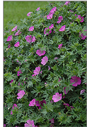
Bloody Cranesbill flowers