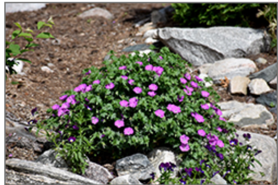
Bloody Cranesbill in bloom