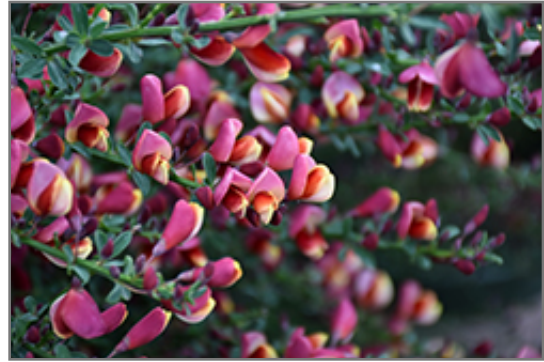
Burkwood's Broom flowers