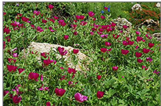
Buffalo Poppy flowers