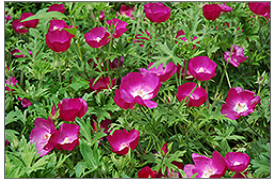
Buffalo Poppy flowers