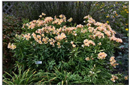
Inca Ice Alstroemeria in bloom