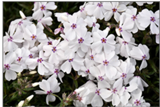
Amazing Grace Moss Phlox flowers