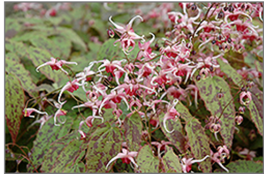
Pink Champagne Fairy Wings flowers