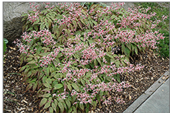
Pink Champagne Fairy Wings in bloom