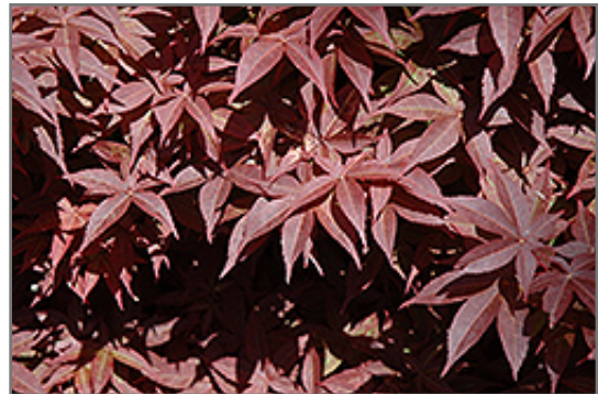
Rhode Island Red Japanese Maple foliage