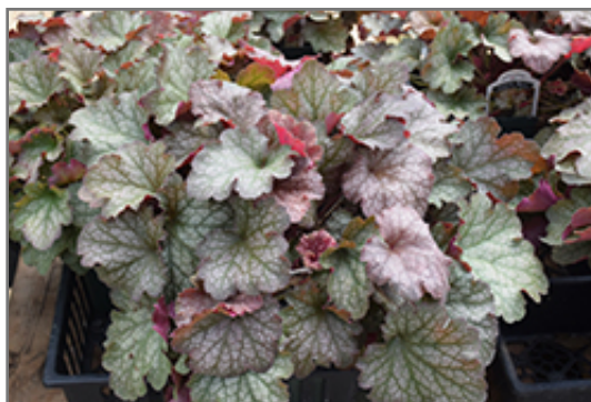
Carnival Fall Festival Coral Bells foliage