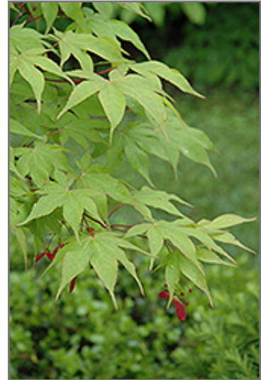
Osakazuki Japanese Maple foliage

This tree does best in full sun to partial shade. You may want to keep it away from hot, dry locations that receive direct afternoon sun or which get reflected sunlight, such as against the south side of a white wall. It prefers to grow in average to moist conditions, and shouldn't be allowed to dry out. It is not particular as to soil pH, but grows best in rich soils. It is somewhat tolerant of urban pollution, and will benefit from being planted in a relatively sheltered location. Consider applying a thick mulch around the root zone in winter to protect it in exposed locations or colder microclimates. This is a selected variety of a species not originally from North America.