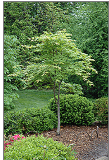
Osakazuki Japanese Maple