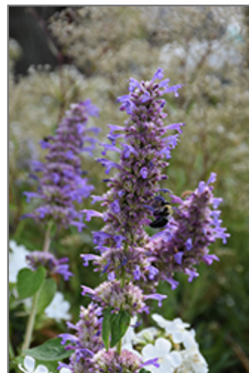
Blue Boa Hyssop flowers