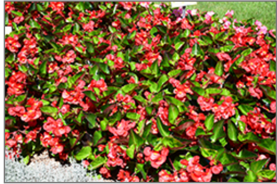
Big Red Green Leaf Begonia in bloom

Big Red Green Leaf Begonia will grow to be about 18 inches tall at maturity, with a spread of 18 inches. When grown in masses or used as a bedding plant, individual plants should be spaced approximately 16 inches apart. Its foliage tends to remain dense right to the ground, not requiring facer plants in front. Although it's not a true annual, this plant can be expected to behave as an annual in our climate if left outdoors over the winter, usually needing replacement the following year. As such, gardeners should take into consideration that it will perform differently than it would in its native habitat.