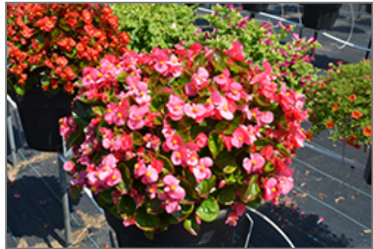
Super Olympia Rose Begonia in bloom