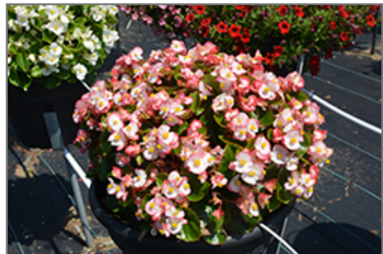
Super Olympia Bicolor Begonia in bloom