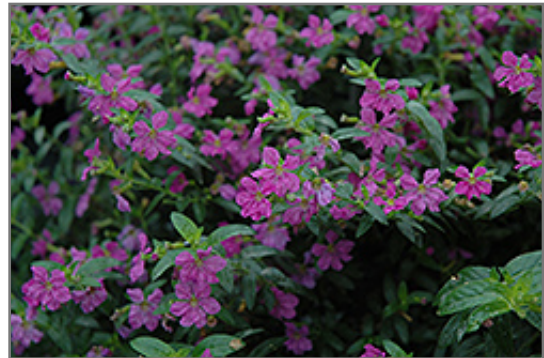
Allyson Mexican Heather flowers