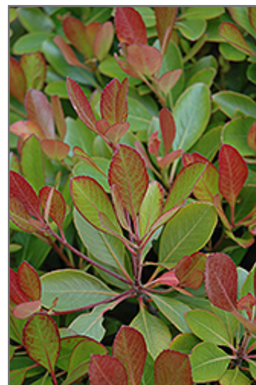
Indian Hawthorn foliage