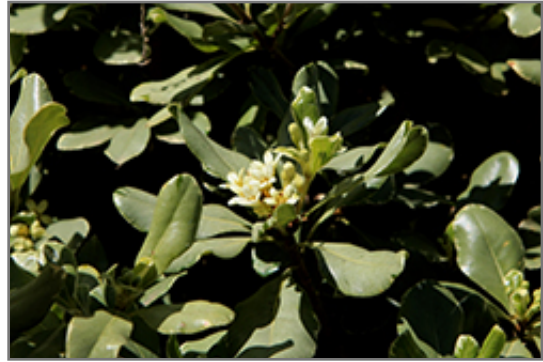
Indian Hawthorn flowers

This shrub does best in full sun to partial shade. It prefers to grow in average to moist conditions, and shouldn't be allowed to dry out. It is not particular as to soil type or pH. It is somewhat tolerant of urban pollution. This species is not originally from North America.