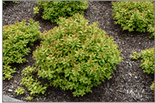
Dakota Goldcharm Spirea

This shrub should only be grown in full sunlight. It prefers to grow in average to moist conditions, and shouldn't be allowed to dry out. It is not particular as to soil type or pH. It is highly tolerant of urban pollution and will even thrive in inner city environments. This is a selected variety of a species not originally from North America.