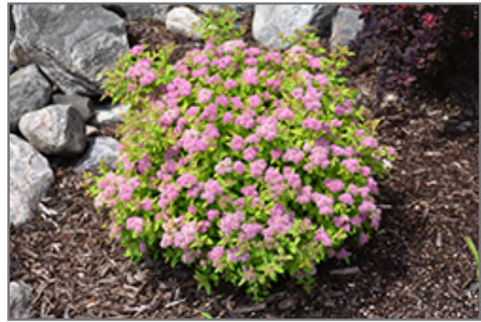
Dakota Goldcharm Spirea in bloom

Dakota Goldcharm Spirea is recommended for the following landscape applications;