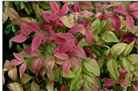
Blush Pink Nandina foliage

Blush Pink Nandina is recommended for the following landscape applications;