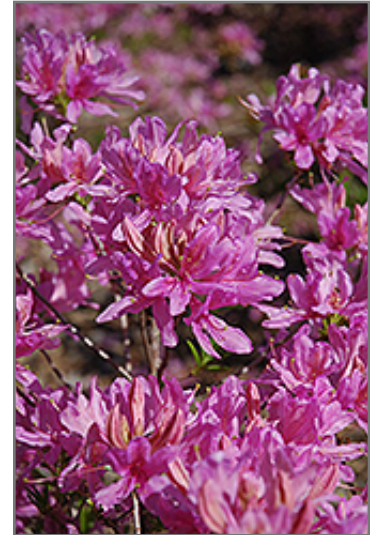
Orchid Lights Azalea flowers