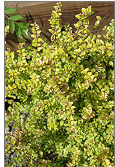
Baggesen's Gold Box Honeysuckle foliage