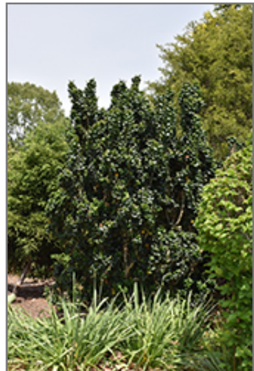
Dwarf Japanese Privet