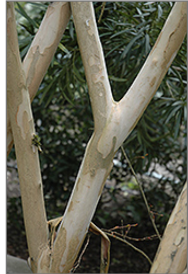
Zuni Crapemyrtle bark

Zuni Crapemyrtle makes a fine choice for the outdoor landscape, but it is also well-suited for use in outdoor pots and containers. Because of its height, it is often used as a 'thriller' in the 'spiller-thriller-filler' container combination; plant it near the center of the pot, surrounded by smaller plants and those that spill over the edges. It is even sizeable enough that it can be grown alone in a suitable container. Note that when grown in a container, it may not perform exactly as indicated on the tag - this is to be expected. Also note that when growing plants in outdoor containers and baskets, they may require more frequent waterings than they would in the yard or garden.