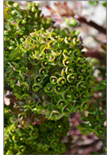
Tiny Tim Spurge flowers

Tiny Tim Spurge is a fine choice for the garden, but it is also a good selection for planting in outdoor pots and containers. It is often used as a 'filler' in the 'spiller-thriller-filler' container combination, providing a mass of flowers against which the thriller plants stand out. Note that when growing plants in outdoor containers and baskets, they may require more frequent waterings than they would in the yard or garden.