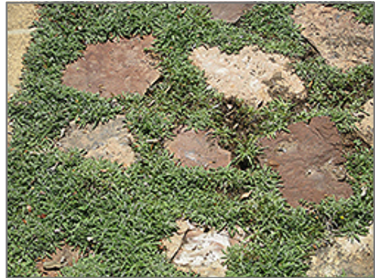
Silver Carpet