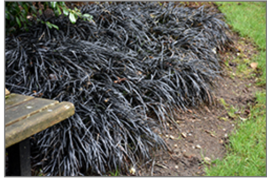
Black Mondo Grass

Black Mondo Grass is recommended for the following landscape applications;