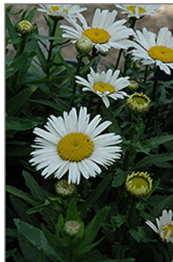
Snow Lady Shasta Daisy flowers

Snow Lady Shasta Daisy is recommended for the following landscape applications;