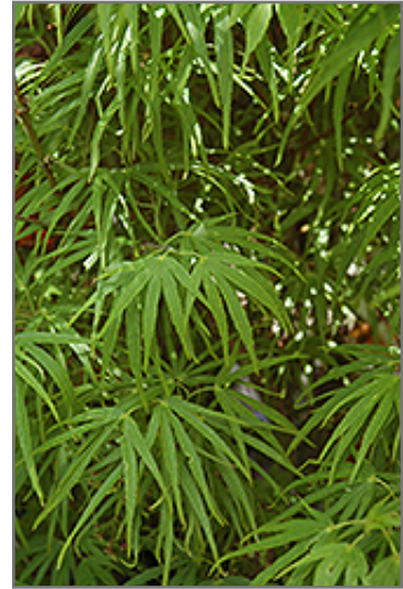
Scolopendrifolium Japanese Maple foliage

Scolopendrifolium Japanese Maple is recommended for the following landscape applications;