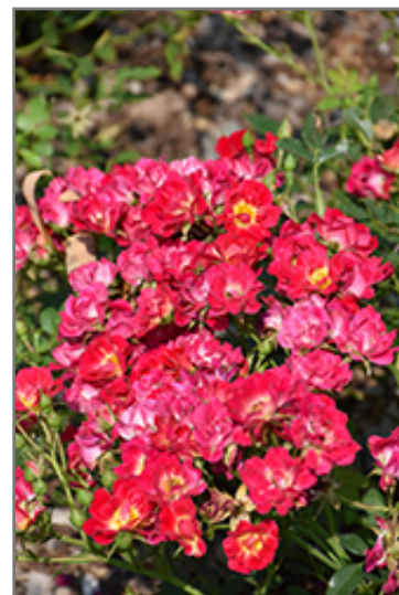
Pink Drift Rose flowers

Pink Drift Rose is recommended for the following landscape applications;