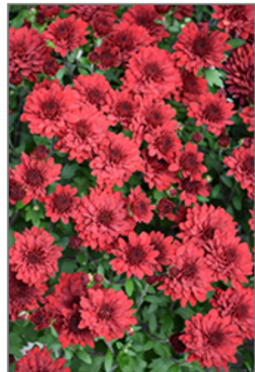
Five Alarm Red Chrysanthemum flowers