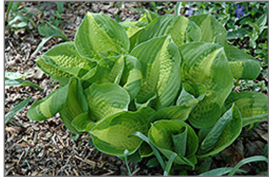
Summer Music Hosta

Summer Music Hosta will grow to be about 18 inches tall at maturity extending to 26 inches tall with the flowers, with a spread of 32 inches. When grown in masses or used as a bedding plant, individual plants should be spaced approximately 28 inches apart. Its foliage tends to remain dense right to the ground, not requiring facer plants in front. It grows at a medium rate, and under ideal conditions can be expected to live for approximately 10 years. As an herbaceous perennial, this plant will usually die back to the crown each winter, and will regrow from the base each spring. Be careful not to disturb the crown in late winter when it may not be readily seen!