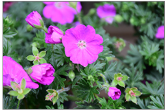
Max Frei Cranesbill flowers

Max Frei Cranesbill will grow to be about 8 inches tall at maturity, with a spread of 12 inches. When grown in masses or used as a bedding plant, individual plants should be spaced approximately 10 inches apart. Its foliage tends to remain low and dense right to the ground. It grows at a medium rate, and under ideal conditions can be expected to live for approximately 10 years. As an herbaceous perennial, this plant will usually die back to the crown each winter, and will regrow from the base each spring. Be careful not to disturb the crown in late winter when it may not be readily seen!