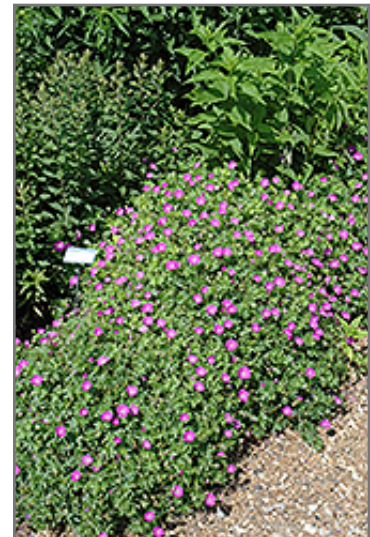
Max Frei Cranesbill in bloom