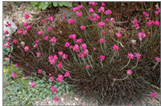
Red-leaved Sea Thrift in bloom