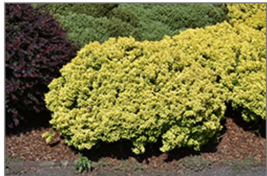
Golden Nugget Japanese Barberry