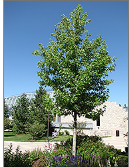
Sweet Gum

This tree should only be grown in full sunlight. It prefers to grow in average to moist conditions, and shouldn't be allowed to dry out. It is very fussy about its soil conditions and must have rich, acidic soils to ensure success, and is subject to chlorosis (yellowing) of the foliage in alkaline soils. It is somewhat tolerant of urban pollution. This species is native to parts of North America.