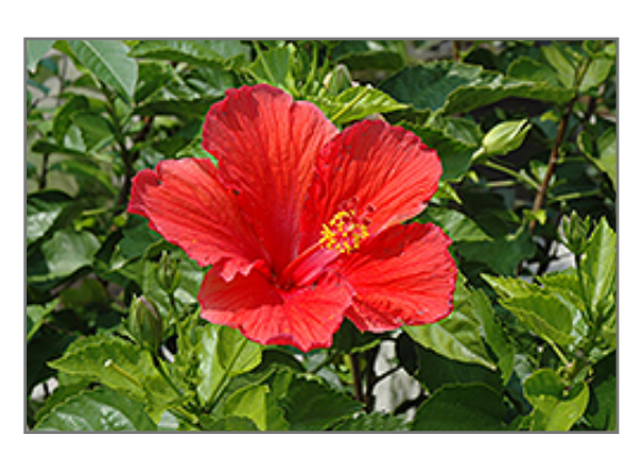
Red Hibiscus flowers

Red Hibiscus is a fine choice for the garden, but it is also a good selection for planting in outdoor pots and containers. With its upright habit of growth, it is best suited for use as a 'thriller' in the 'spiller-thriller-filler' container combination; plant it near the center of the pot, surrounded by smaller plants and those that spill over the edges. It is even sizeable enough that it can be grown alone in a suitable container. Note that when growing plants in outdoor containers and baskets, they may require more frequent waterings than they would in the yard or garden.