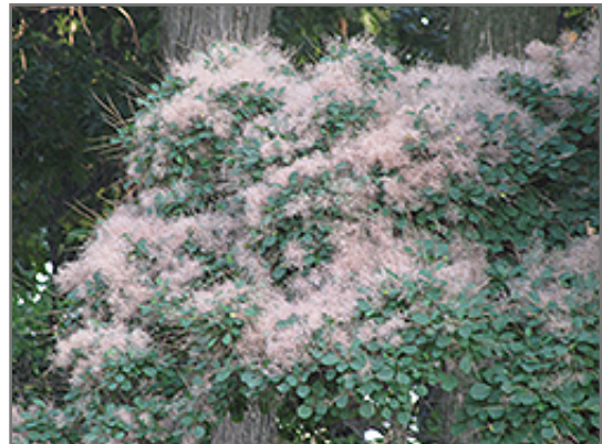
American Smoketree in bloom