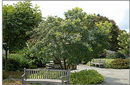
American Smoketree in bloom

American Smoketree is recommended for the following landscape applications;