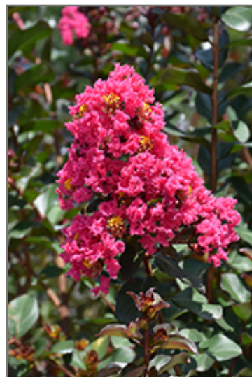
Pink Velour Crapemyrtle flowers