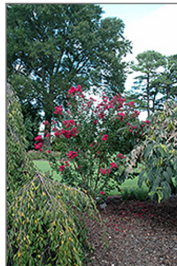
Pink Velour Crapemyrtle in bloom